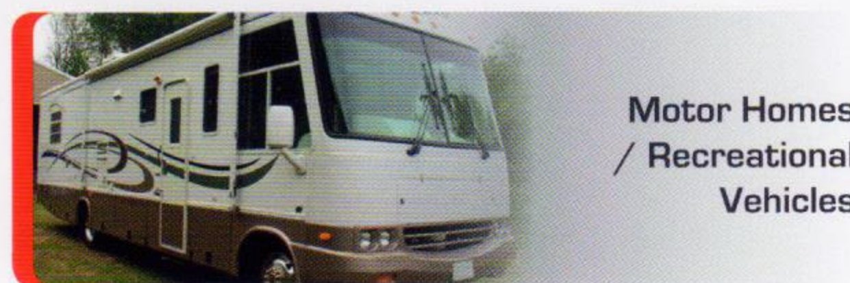
Motor Homes / Recreational Vehicles